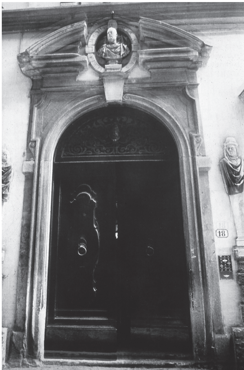
Fig. 3. Entrance of Palazzo Valori, with the bust of Cosimo I, Florence.